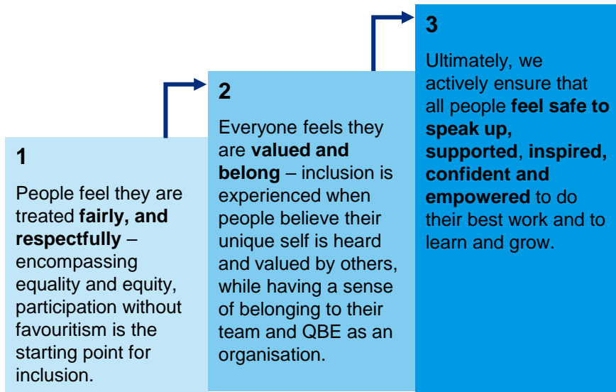
The inclusion staircase

We define inclusion through three building steps :